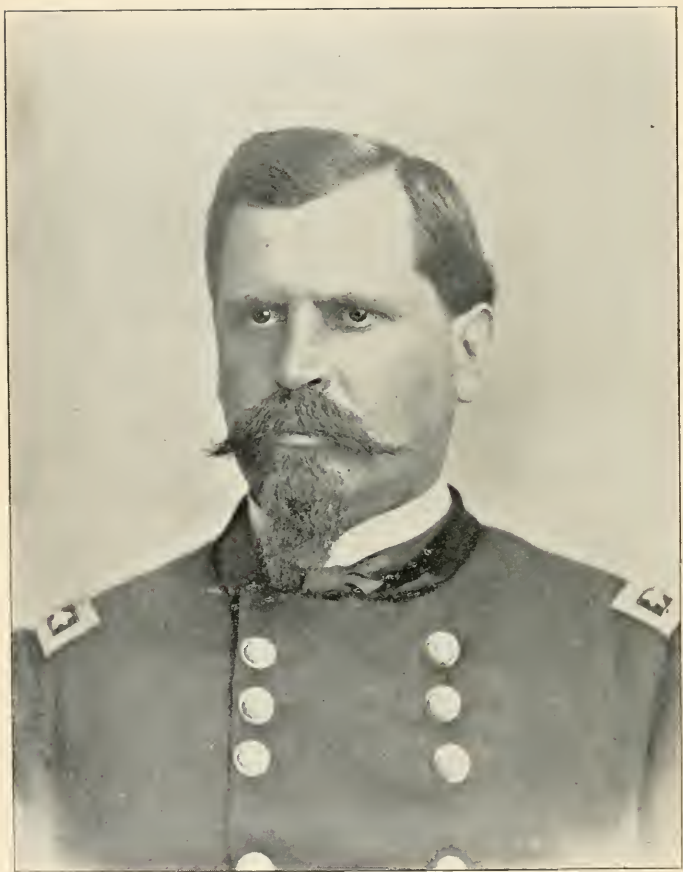
WILLIAM B. HAZEN.

Captain 8th Infantry, U. S. A.; Colonel 41st O. V. I.; Brig. Gen. U. S. Vols.; Maj. Gen. U. S. Vols.; Colonel 37th Infantry, U. S. A. Brigadier General U. S. A.